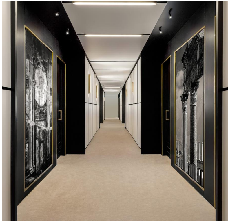
1. Suite Boudoir — 2. Landscape — 3. Hallway

Rooms — HABITA79 Hotel & Spa Pompeii houses 79 rooms featuring modern tailor-made design: 7 suites, 3 triple rooms, 12 communicating rooms and 4 HD rooms. Each room is provided with air conditioning, automation, high speed Wi-Fi, USB charger, 48" SMART TV, safe with charging socket, mini bar, 24/7 room service and laundry service.